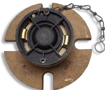
Storz adaptor and cap