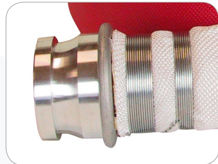
Wired in hose