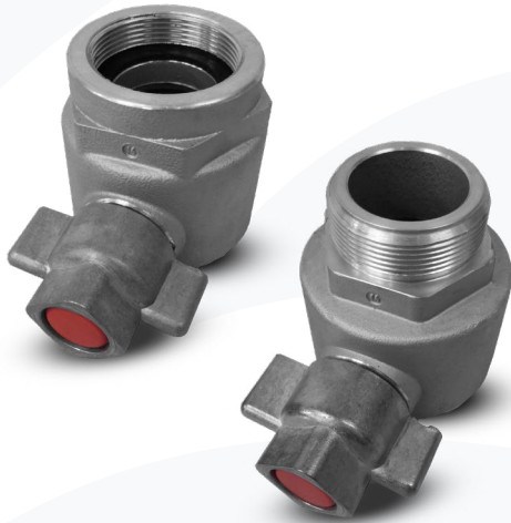
64mm INST FEMALE x BSP THREAD

Instantaneous adaptors allow threaded pipework or hose connections to be converted to an Instantaneous system and can also be used to connect two differing hose system types (16 Bar).