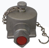
Insta vented caps