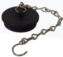
Rubber caps & plugs