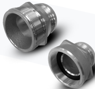
64mm INST MALE x BSP THREAD