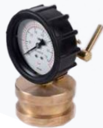
Insta pressure gauge plug