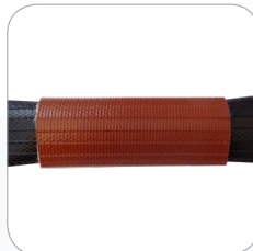
Hose repair sleeves available