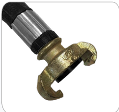
European compressor fittings