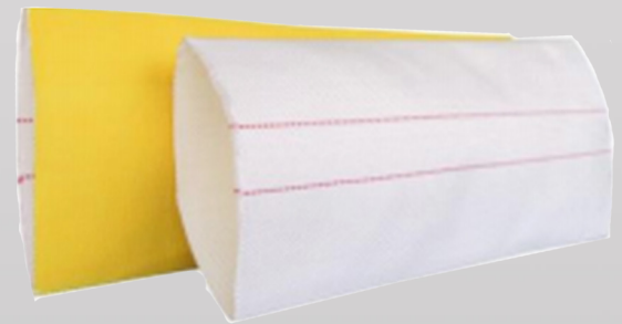
One side plain, one side PU coated

Aeration of bulk powders and granular in silos and silo wagons.