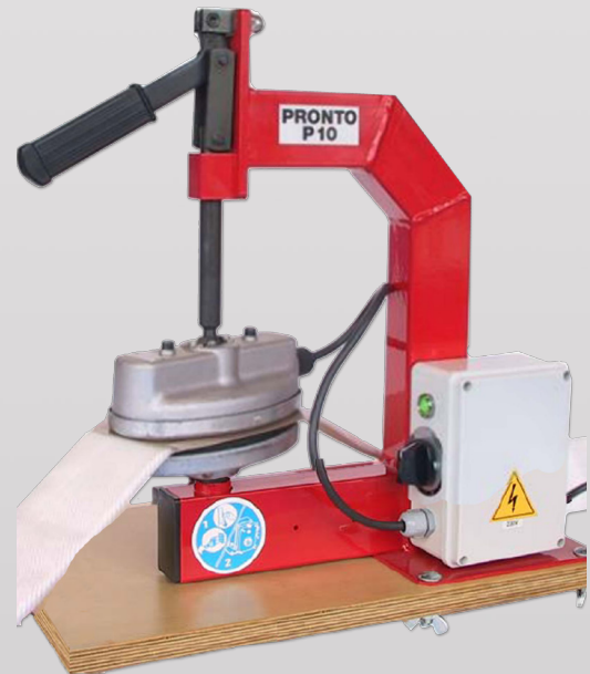
Pronto with hose